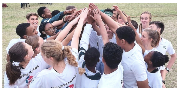
ABOVE: On 5 November, six Union teams participated in Hoër Volkskool's night relay . The challenge was to run a 5 kilometre relay route through their school grounds. The spirited learners had a great time and we congratulate them all on participating and thank them for their enthusiasm, team spirit and for giving it their best!